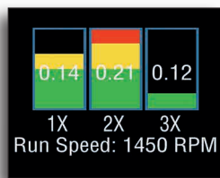
Display on vibrometer unit. Analyze.